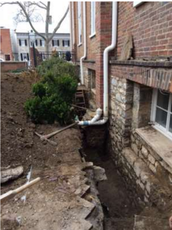
This was the 2017 project sealing the foundation walls of the church to keep the basement nice and dry.