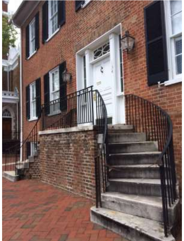
The Old Rectory Porch re-do project is out for bid and projected for spring 2018!