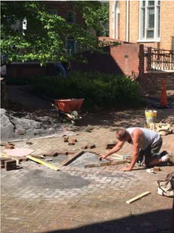
The masons worked on the brick courtyard this summer to improve drainage.