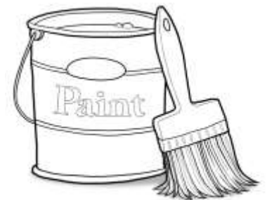
Doors and trim got fresh white paint in 2017 too!