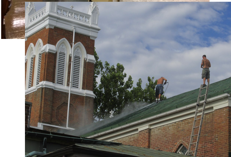
Washing the church roof before painting

2016 was a busy year around the buildings and grounds of Christ Church!