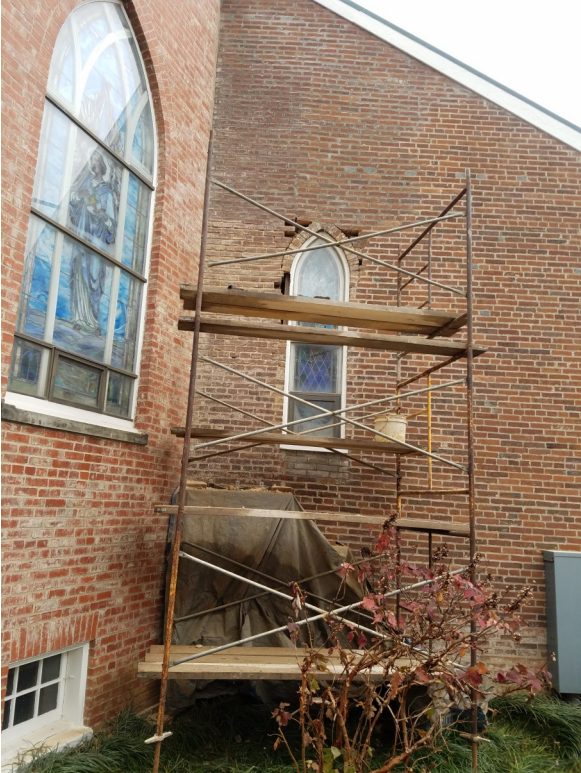
Work on Page Chapel window