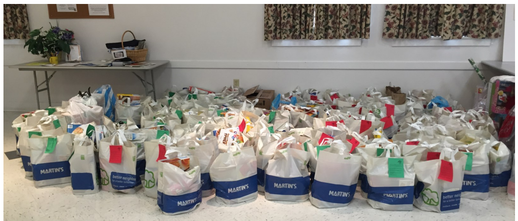
Bags of donated food in the Tilford Room

And, the Christ Church community was so generous in purchasing gifts, bicycles and clothes, and donating money, for 145 children who would not have had a merry time during the Christmas holidays. Thank you to all who helped out with The Angel Tree program—from handing out the angels to the gathering of gifts, and a huge thank you to all of you who joined in transporting the gifts to the Salvation Army distribution center.