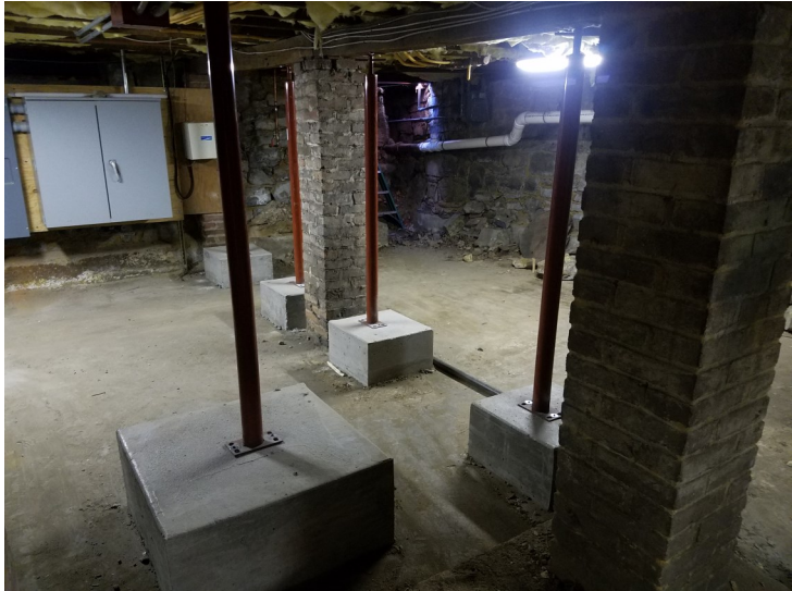
Smith Building Basement—before and after