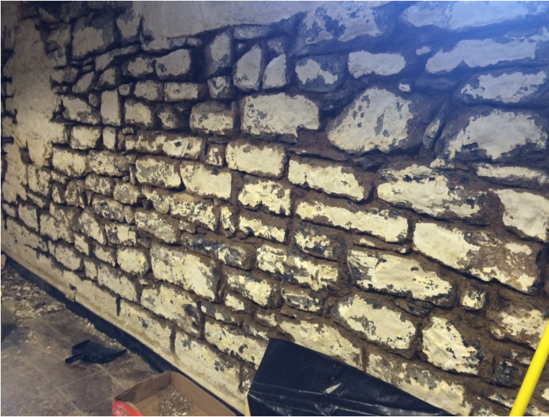
Lord Fairfax Room (church basement) —before and after