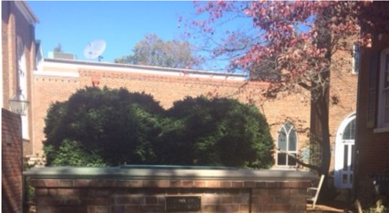
Courtyard—before and after